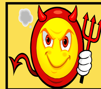
Good and bad Fat in the blood